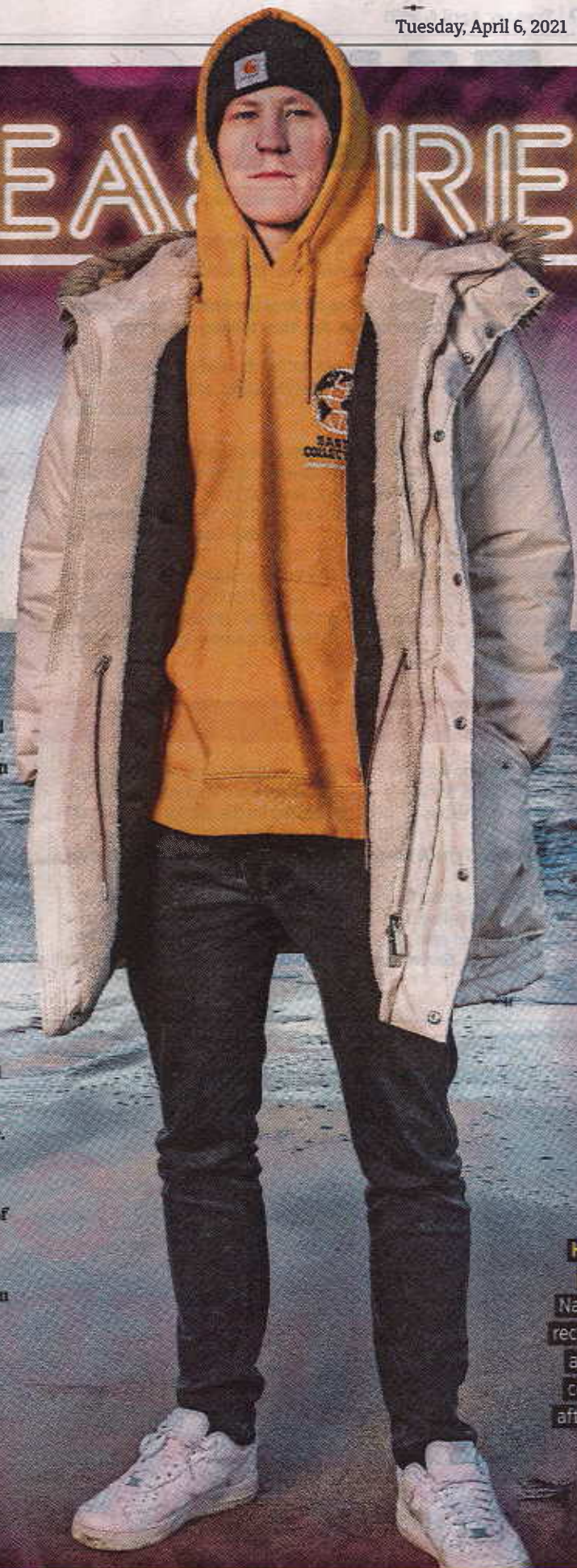
His ship's come in: Nathan has record deals and a tour coming up after 'tough time'

Nathan's Wellerman (220 Kid and Billen Ted Remix) is heading back towards No.1, and tickets for his UK tour are available at LiveNation.co.uk .