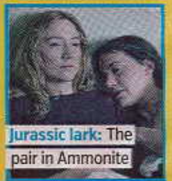
Jurassic lark: The pair in Ammonite

Oscar-winner Kate, 45, who plays Victorian fossil hunter Mary Anning, said: 'I can tell you that there were private things shared between myself and Francis and Saoirse connected to our own paths et cetera that we felt were relevant to add to these characters - and those aren't things that I'd be really sharing publicly.'